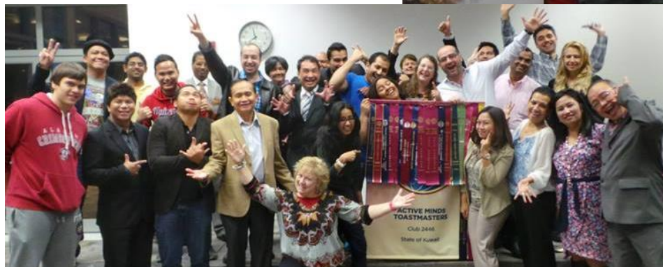
Active Minds Advanced Speakers, their evaluators and the meeting functionaries